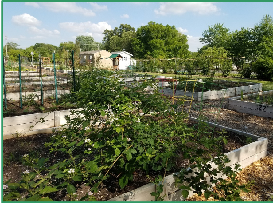
Spring has arrived! Rental garden beds grow a variety of well-tended plants at the Community Garden

May Meeting at the Garden – perfect weather, delicious food, and lots of enjoyable conversations made for a delightful evening at the Community Garden on May 1 st . While it was our designated monthly membership meeting there was no business conducted; however, there was a great deal of talking on a variety of subjects, some of them even gardening related. Maybe we should schedule a few more meetings like this?